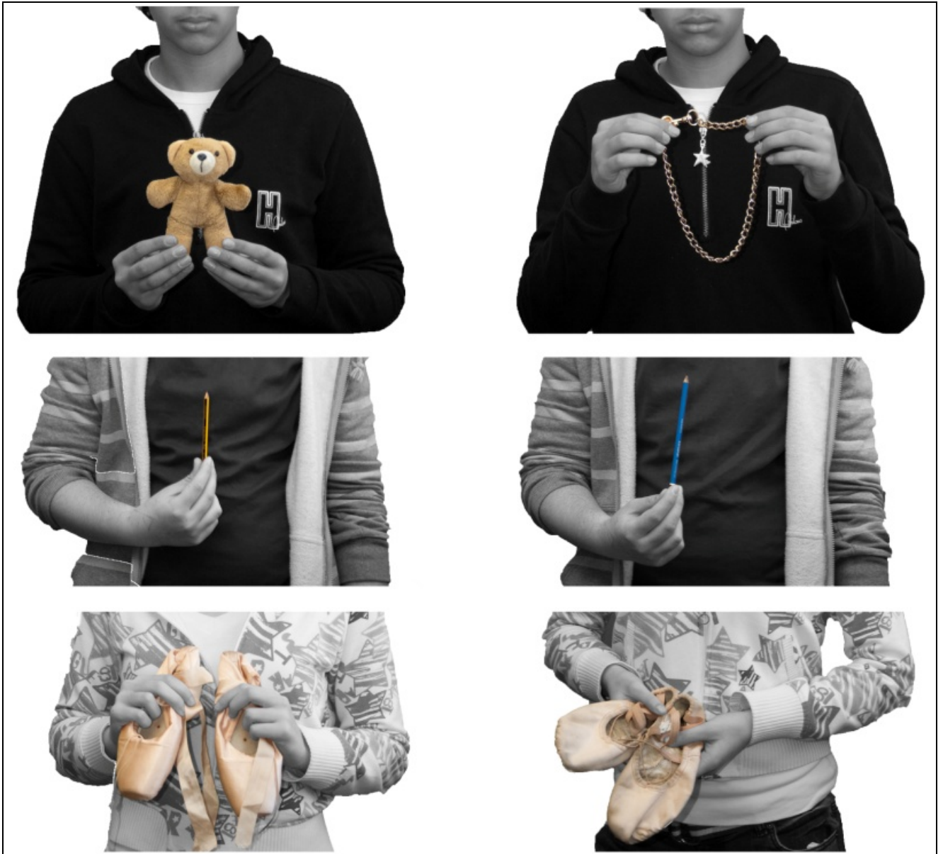
Figure 5. Author (2009) Students Portrait and Self-Potrait . Photo Series composed by six photos by the author.