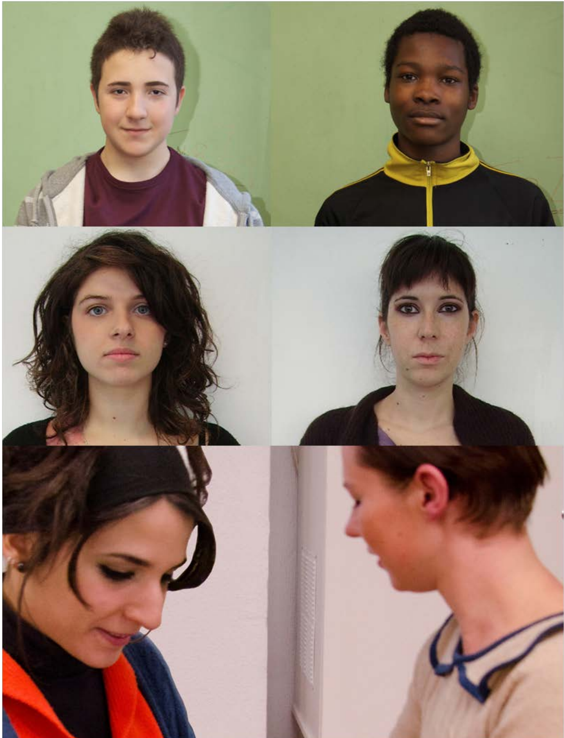
Figure 1. Author (2014) Students, artist and teachers . Photo Series composed by six photos by the author. Top left, (2012) Middle school Student 1 ; top right, (2012) Middle school Student 2 ; centre left, (2009) Selfportrait ; centre right, (2009) Claudia portrait ; down left, (2013) Granada student 1 , and down right, (2013) Granada student 2 .

Here below we present our visual methodology that includes a selection of subjects (middle school students, artists and teachers in training, and university students), objects selected by the subjects and the used references.