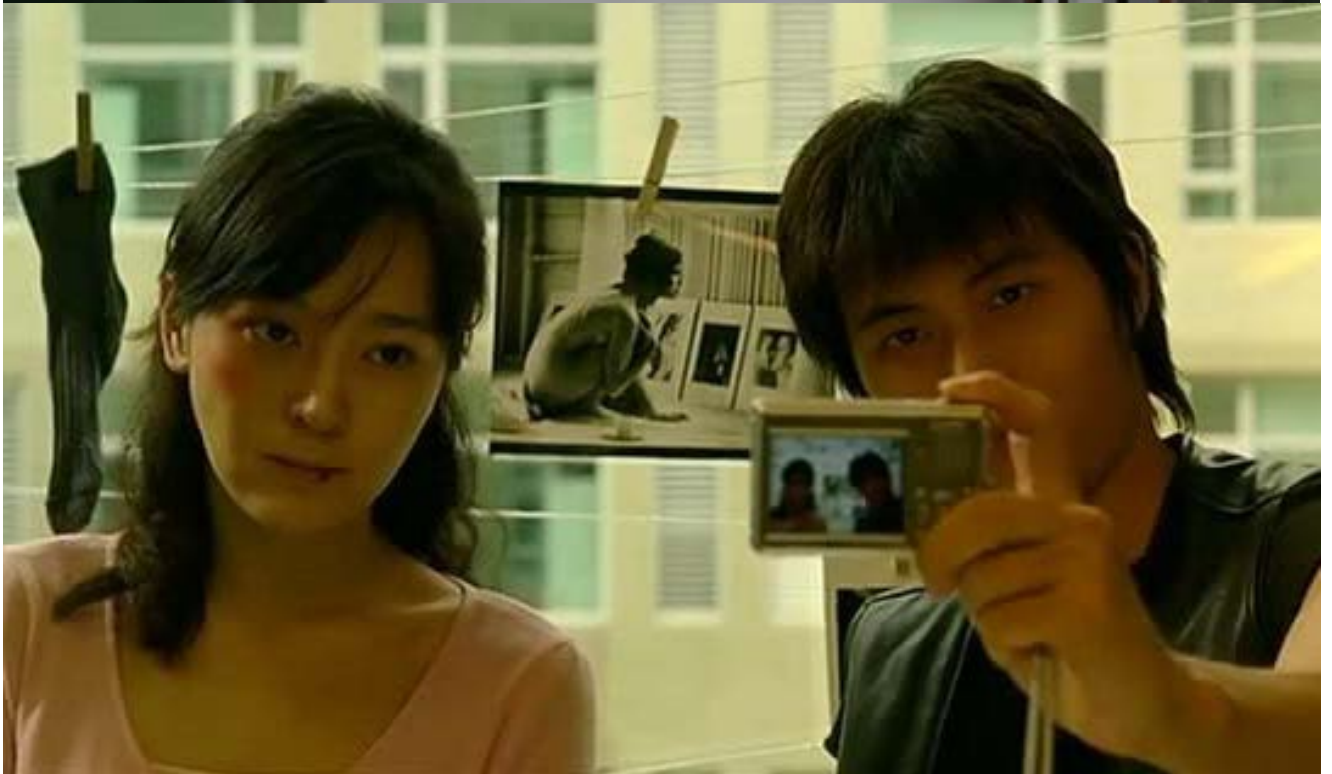
Figure 6. Author (2014) Hanging Fotos . Photoessay composed by a photos by author (top) and a Direct Visual Quotation (Ki-Duk, 2004).