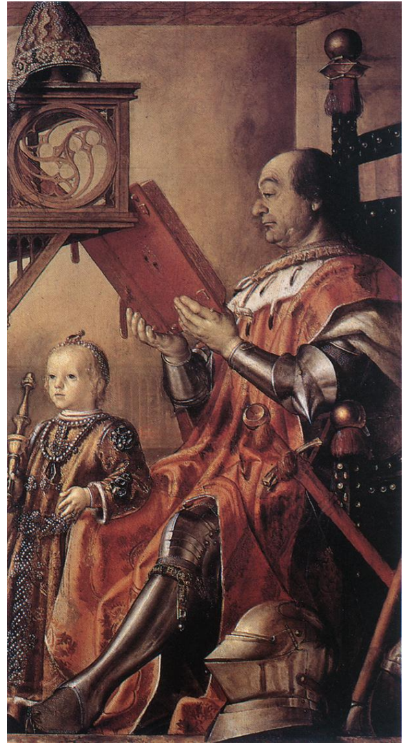
Figure 7. Author (2014) Status . Photoessay composed by a photo by author (left) and a Direct Visual Quotation (right) (Berruguete, 1497).