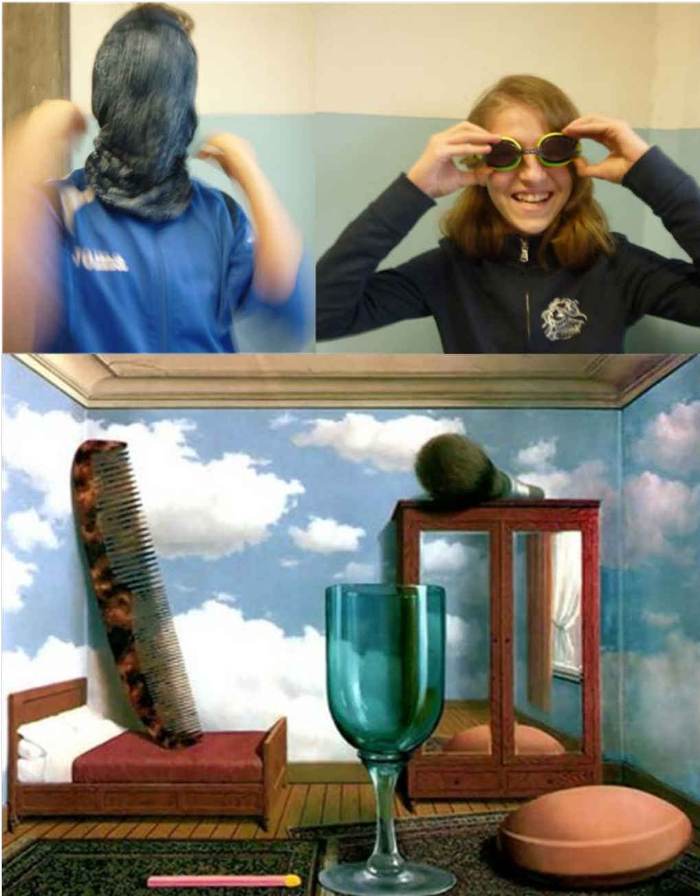
Figure 4. Author (2014) Out-of-place Dreams . Photoessay composed by two photos by author (top) and a Direct Visual Quotation (Magritte, 1952).

The artist-teachers in training took pictures of themselves (portraits and self-portraits) and printed them on t-shirts. Also they set up the t-shirts in a room hanging these, as to dry, on a wire and they positioned within the room all chosen objects, creating a dwelling inspired by the movie 3-Iron (Kim Ki-Duk, 2004). The university students created with their objects, assemblages and small installations within the Educational Sciences Faculty mostly humanizing chairs, tables, corners of the floor, creating their metaphoric double self-portraits.