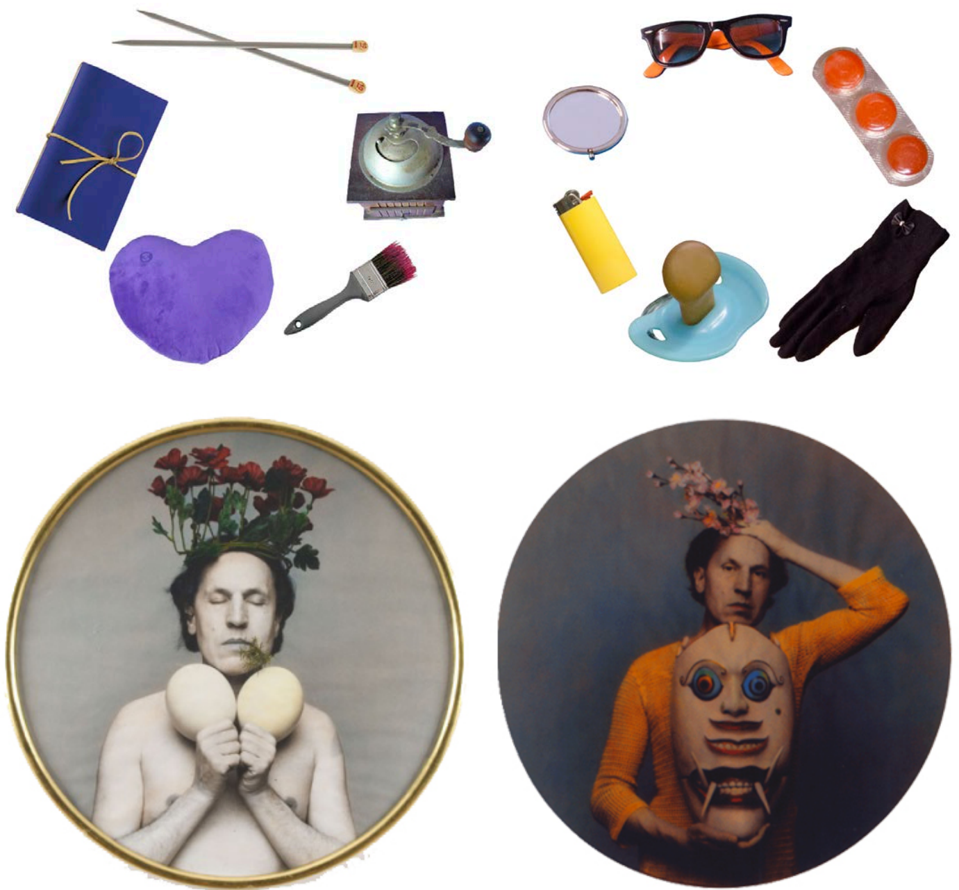
Figure 3. Author (2014) Circle Toys . Photoessay composed by two photos by author (top) and two Direct Visual Quotation (Ontani, 1970 and 1997)